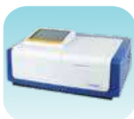
UV/VIS Spectro 2080+ Double Beam

Analytical Technologies is synonymous for offering technologies for doing analysis and is the Fastest Growing Global Brand having presence in at least 96 countries across the global. Analytical Technologies Limited is an ISO:9001 Certified Company engaged in Designing, Manufacturing, Marketing & providing Services for the Analytical, Chromatography, Spectroscopy, Bio Technology, Bio Medical, Clinical Diagnostics, Material Science & General Laboratory Instrumentation. Analytical Technologies, India has across the Country operations with at least 4 Regional Offices, 6 Branch Offices & Service Centers. Distributors & Channel partners worldwide.